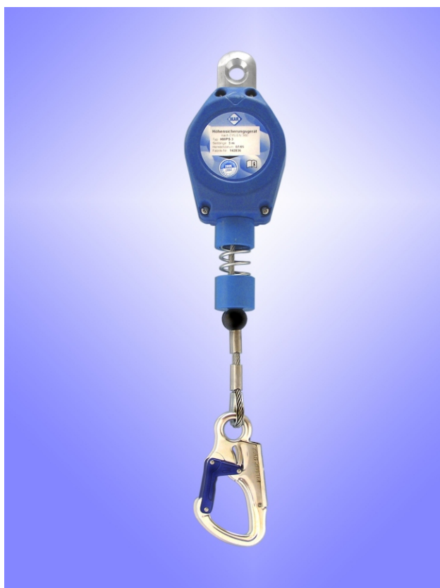
Art.-No.: 41-HWPS 3